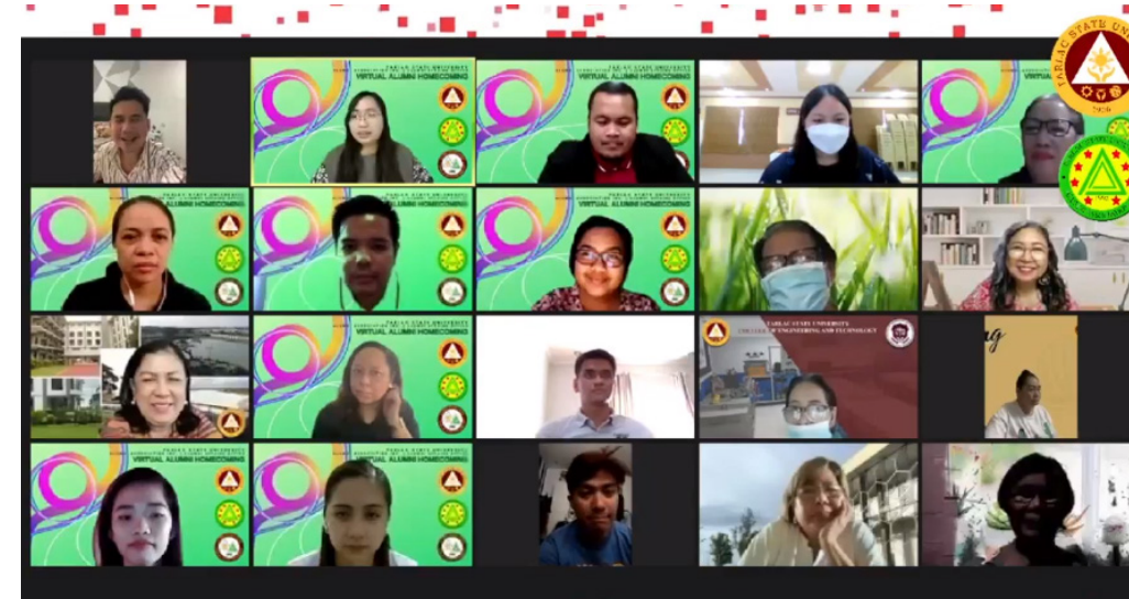
• Alumni Affairs Office • TSU 1st Alumni Zoomcoming 2021 • Tarlac State University Alumni Association Inc.

The Tarlac State University Alumni Association Inc. held their annual alumni homecoming via Zoom or “ZoomComing” last October 16, 2021 presenting their new target projects and newly established local and international chapters.