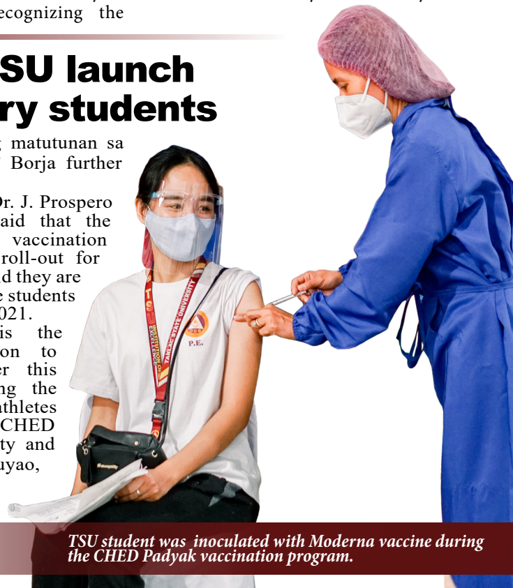
TSU student was inoculated with Moderna vaccine during the CHED Padyak vaccination program.

Tarlac province is the first in Northern Luzon to vaccinate students under this CHED program following the vaccination for student-athletes last October 20 at the CHED auditorium in Quezon City and tertiary students in Cabuyao, Laguna.