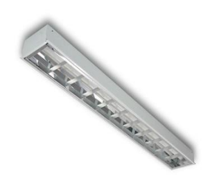
1 x 18W T8 Tube light Troffer type with Louver and Aluminum reflector Surface mounted (Daylight)